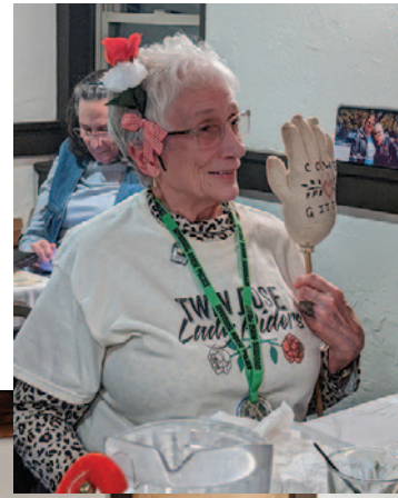
The Hand always makes an appearance.